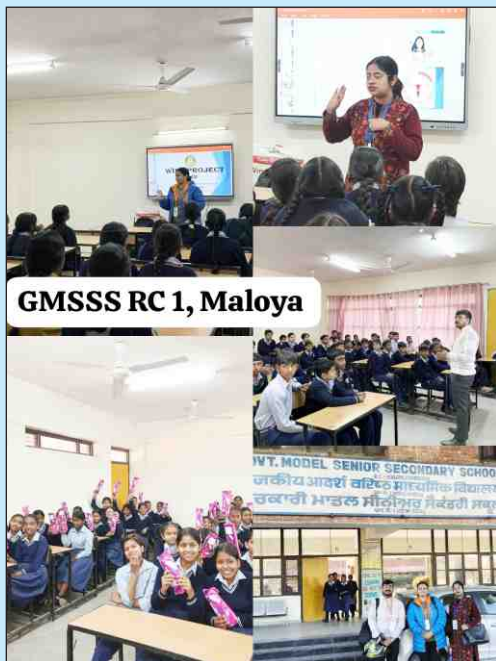
GMSSS RC 1, Maloya